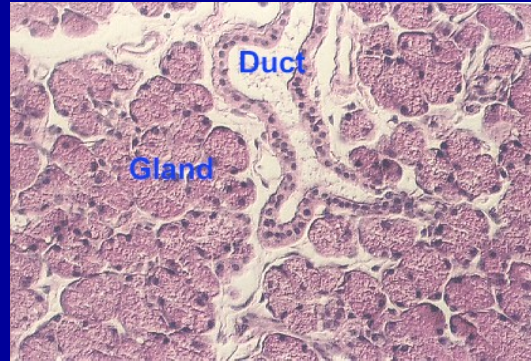
Salivary gland anatomy parameterization of ductal cells

Dose to ductal cells greater than average dose to SG (conversion factor size and isotope dependent)